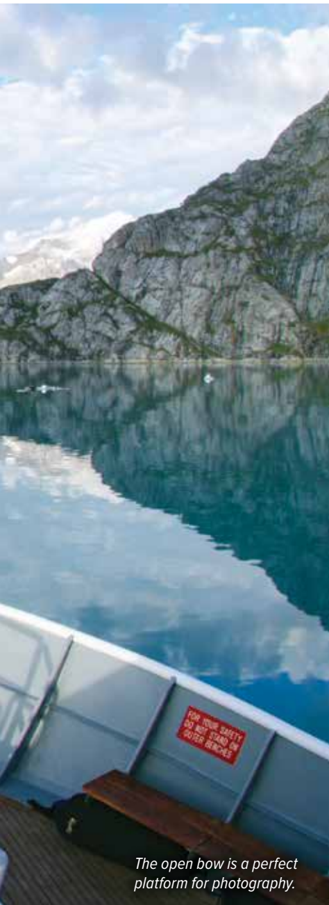
The open bow is a perfect platform for photography.

Aboard the newly renovated National Geographic Sea Bird & Sea Lion , daily dining is a nourishing and satisfying experience, thanks to a hotel staff committed to sourcing the highest quality, sustainable local products available, and we think you'll taste the difference. Everything we serve tells a story, from local huckleberry jam to the weekly menu changes based on what local fishermen are catching. Dinner is served in our freshly appointed dining room, invariably following cocktails, hors d'oeuvres, and our signature evening 'Recap' held in the lounge, recently outfitted with a state-of-the-art presentation system and ample space to accommodate all. And, you'll find every cabin aboard the perfect place to end your active day with all new furnishings and comfortable beds, including our signature feather duvets.