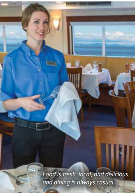
Food is fresh, local, and delicious, and dining is always casual.