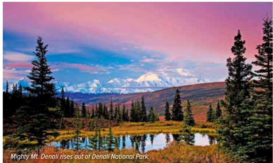
Mighty Mt. Denali rises out of Denali National Park.

Depending on your departure date, you may be responsible for one night on your own before or after joining the Denali extension. Please call for details.