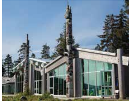
Left: Native Hamatsa dancer inside Big House at Alert Bay. Right: Totem poles at the Haida Heritage Centre. Below: Traditional Haida carving.