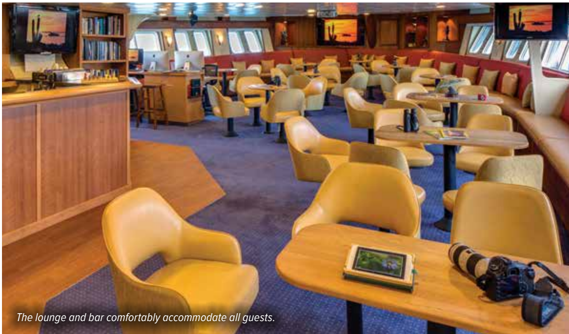
The lounge and bar comfortably accommodate all guests.