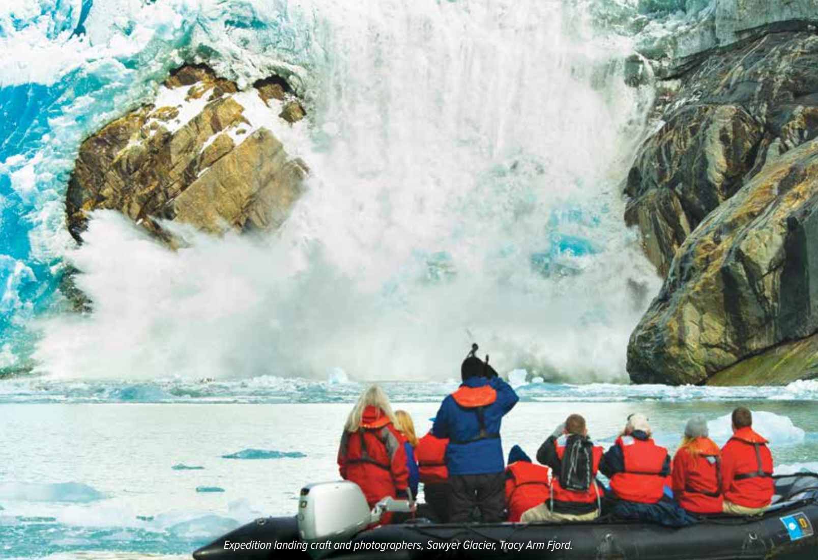
Expedition landing craft and photographers, Sawyer Glacier, Tracy Arm Fjord.