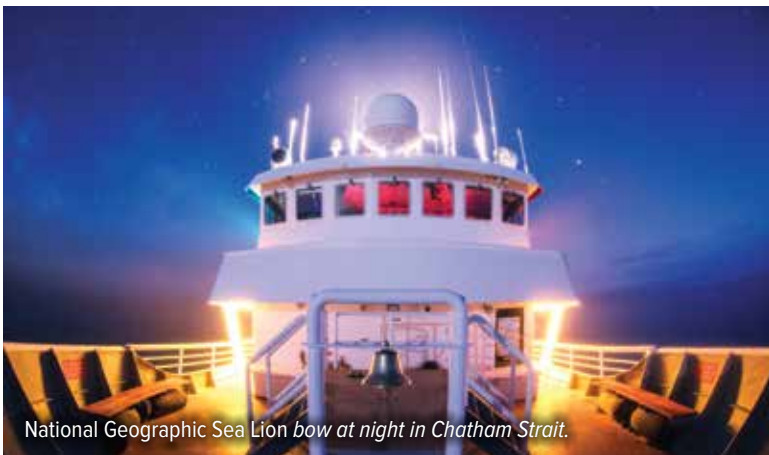
National Geographic Sea Lion bow at night in Chatham Strait.

TRAVELING AS A GROUP: Save 5% when traveling as a group of 8 or more people. Take advantage of these great savings, while enjoying traveling with your friends and family. This savings is applicable on voyage fares only, and not on extensions or airfare. Deposit, final payment, and cancellation policies for group travel vary from our regular policies.