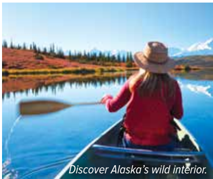
Discover Alaska’s wild interior.

In the morning visit the University of Alaska Fairbanks Museum, featuring collections that represent over 11,000 years of cultural traditions in the North. In the late morning we depart on a wildlife drive to our temporary home located within the heart of the park, the North Face Lodge. We’ll travel in the lodge’s private buses, on the otherwise highly restricted Denali Park Road, in order to access prime wildlife viewing areas; a privilege extended to the owners of North Face Lodge and their guests. The seven-hour,