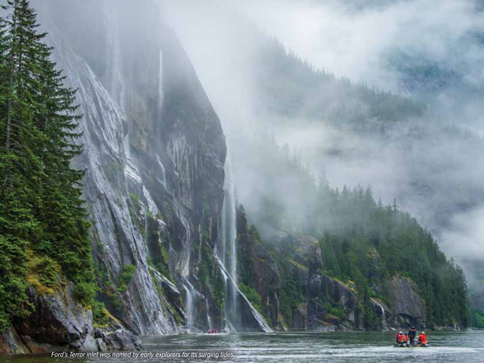
Ford's Terror inlet was named by early explorers for its surging tides.