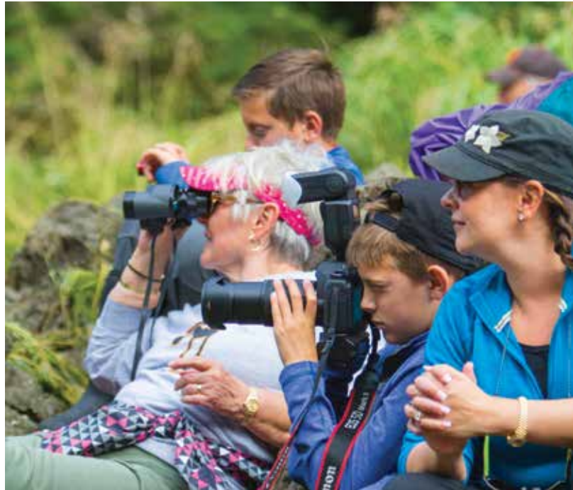
Clockwise from far left: Tide pooling as an exercise in micro-ecosystems; photo outings accommodate all ages and skill levels; family expedition landing craft cruise; exploring the intertidal zone.