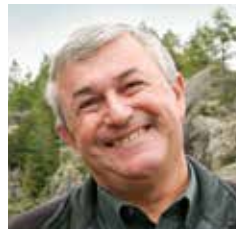
FLIP NICKLIN AUG. 27 & SEP. 3 Alaska resident and legendary marine mammal photographer.