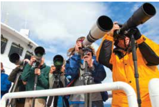
From smartphones to point & shoot, to DSLRs, our staff will offer insight along the way.

Make the most of Alaska's long days and unrivaled photo ops. Our Expedition Photography program will enable you to "see" glaciers, whales, bears, and eagles with fresh eyes, as our onboard Lindblad Expeditions-National Geographic certified photo instructor offers assistance, instruction, and shooting tips in the field. Their expertise will inspire you, and help you improve your skills—no matter your current skill or interest level—and ensure you return home with incredible photos. You don't need to be a pro photographer to go home from Alaska with great shots! See some guest photos at expeditions.com/AlaskaGuest .