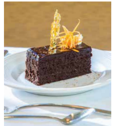
The cuisine on board is fresh, sustainable and accented with a regional flair.