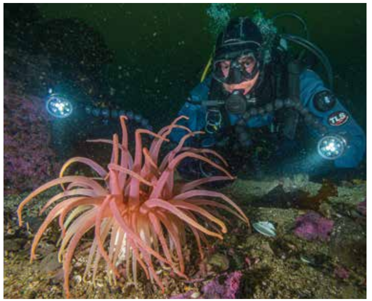
Left: Nutrient-rich water feeds a vibrant, seldom-seen undersea, including these hooded nudibranch. Above: Our undersea specialist's lights reveal the vibrant seafloor of Alaska.

“We found ourselves in a forest of giant plumose anemones...among them hundreds of species of marine invertebrates—each more vibrant than the last. Hermit crabs whose shells had been fully engulfed by sponges, a rare butterfly crab, and six species of sea stars—including the largest on Earth. Sharing the images with everyone aboard brought excitement and shed light on the seldom-seen underwater world.”