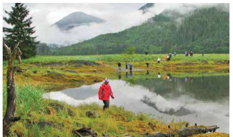
Clockwise from top: Our ships are ideally suited to sail into shallow, fast-moving channels and fjords; hikes occur daily; observe wildlife from a safe distance on naturalist-led kayaking outings.