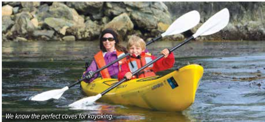
We know the perfect coves for kayaking.

Our Forest Service Special Use Permit for Tongass National Forest enables you to hike and kayak in wild and remote areas of Southeast Alaska.