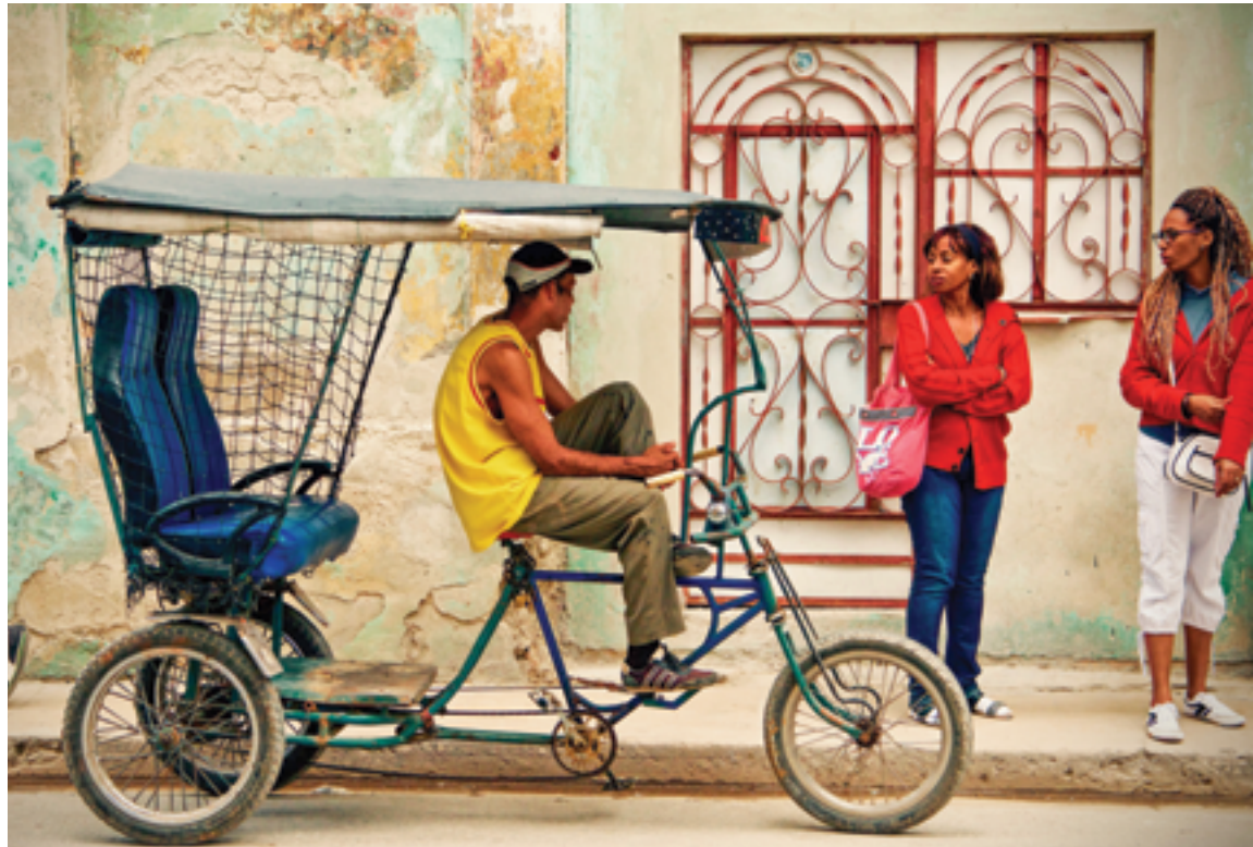
From top, left to right: View across Havana, with the Hotel Nacional in the foreground; woman smoking cigar in Havana; Cuban fruit and vegetable sellers at a covered market; the Capitolio in Havana, modeled after the U.S. Capitol; a street scene; schoolmaster snappers in Jardines de la Reina; a vintage American car.