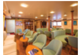
Left to right: Panorama II offers gracious accommodation and comfort; Category 4 cabin; Category 3 cabin; Category 2 cabin; the aft area at the Upper Deck provides generous semi-covered or sun-exposed areas where guests can enjoy meals al fresco, with wonderful views; the comfortable lounge is the hub of social activities and presentations.

For Reservations: Contact your travel advisor or Lindblad Expeditions