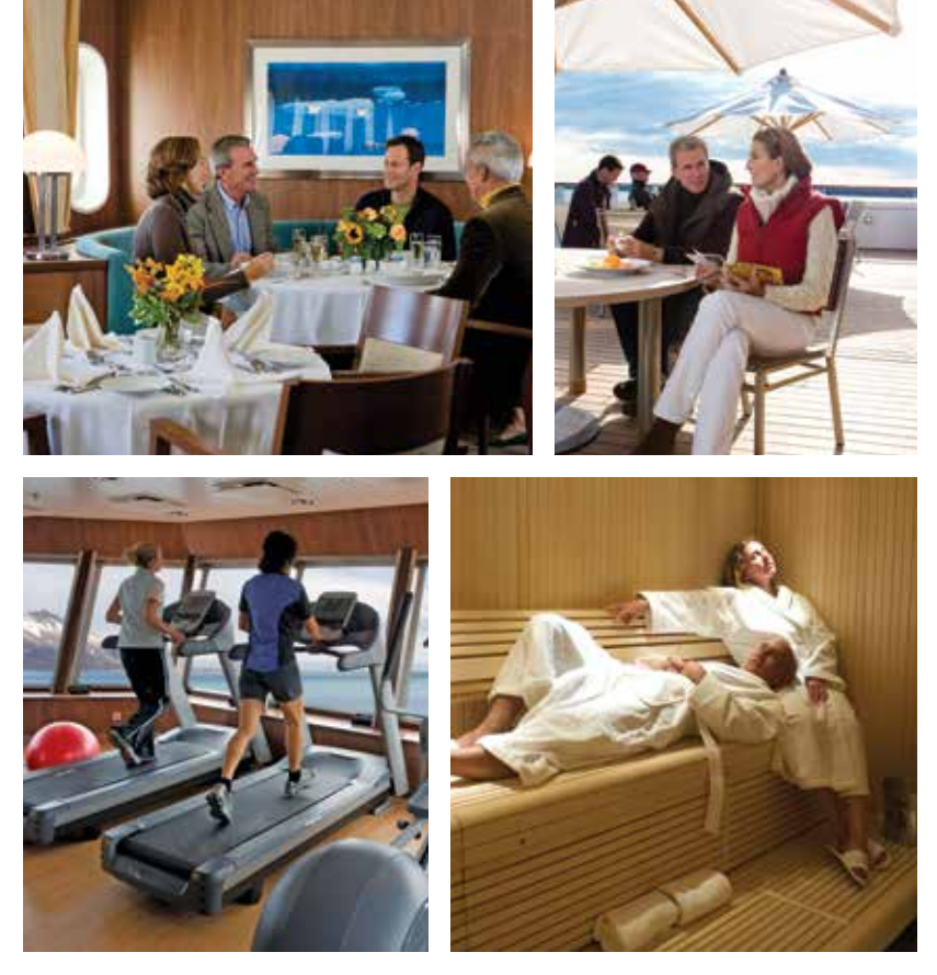
Clockwise from top left: Dining is an interesting and varied experience: completely casual with no assigned seating for easy mingling; the expansive aft deck is a welcoming placeperfect for a snack, tea time or reading; our classic Swedish sauna makes the wellness spa at the top of the ship a perfect place to end an active day; the fitness center with panoramic views.

Special Features: A full-time doctor, undersea specialist, National Geographic photographer, Lindblad-National Geographic certified photo instructor, Global Perspective guest speaker and a video chronicler. Laundry service available.