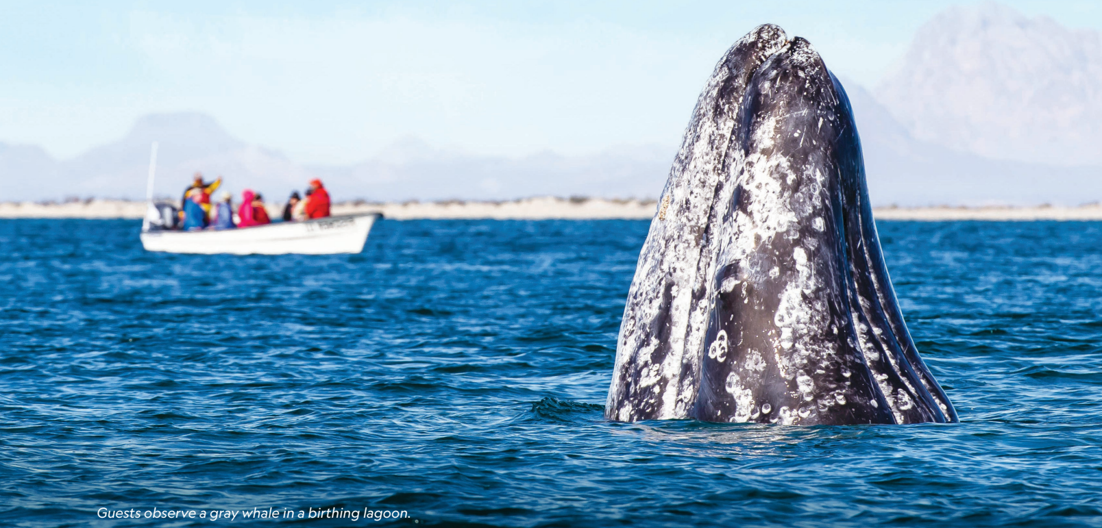
Guests observe a gray whale in a birthing lagoon.