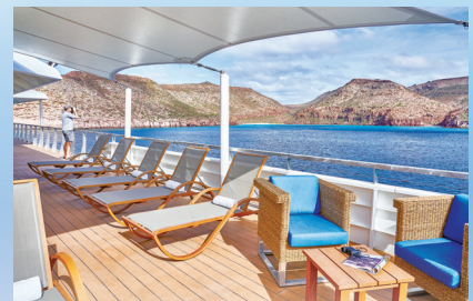
Above: Spacious Category 3 cabin; dining room with floor-to-ceiling windows; comfortable outdoor space for relaxing and wildlife viewing.