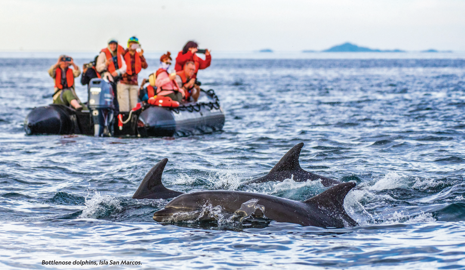
Bottlenose dolphins, Isla San Marcos.