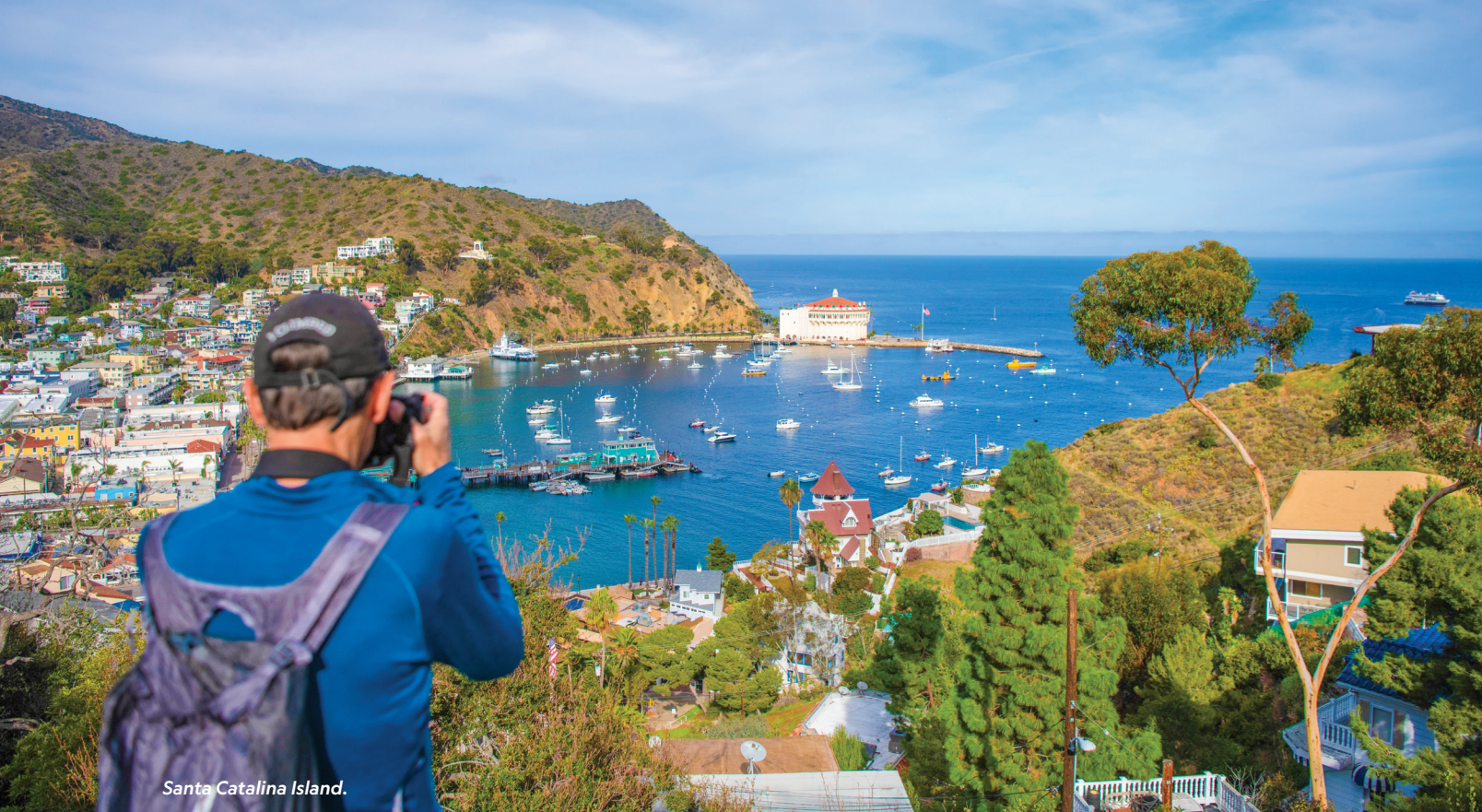
Santa Catalina Island.