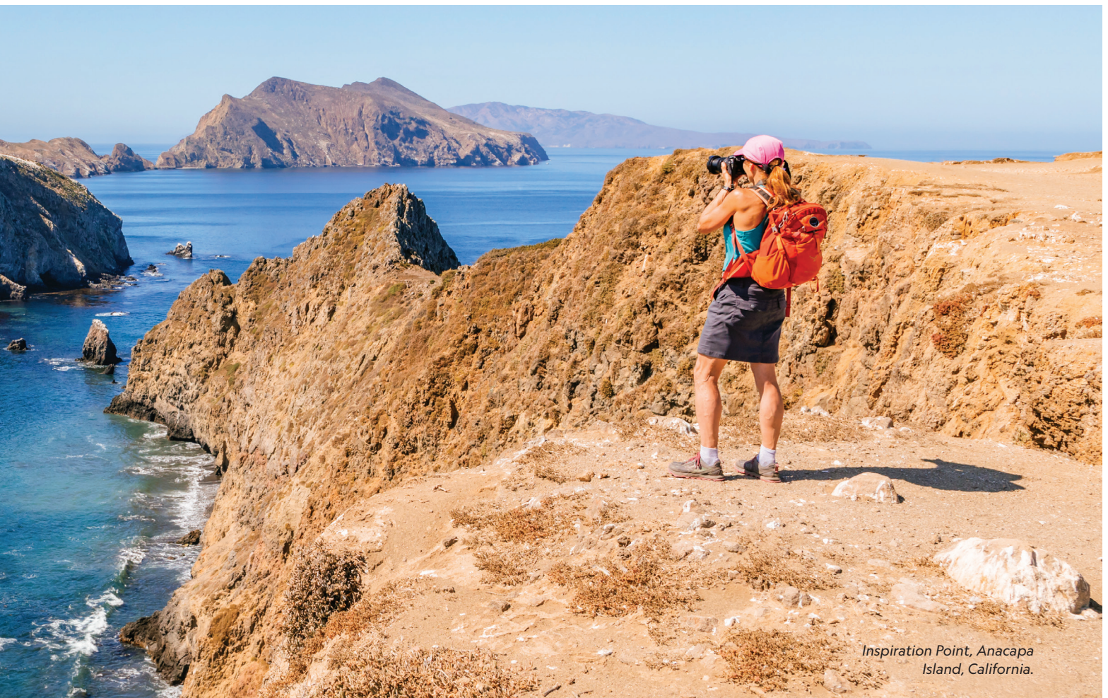
Inspiration Point, Anacapa Island, California.