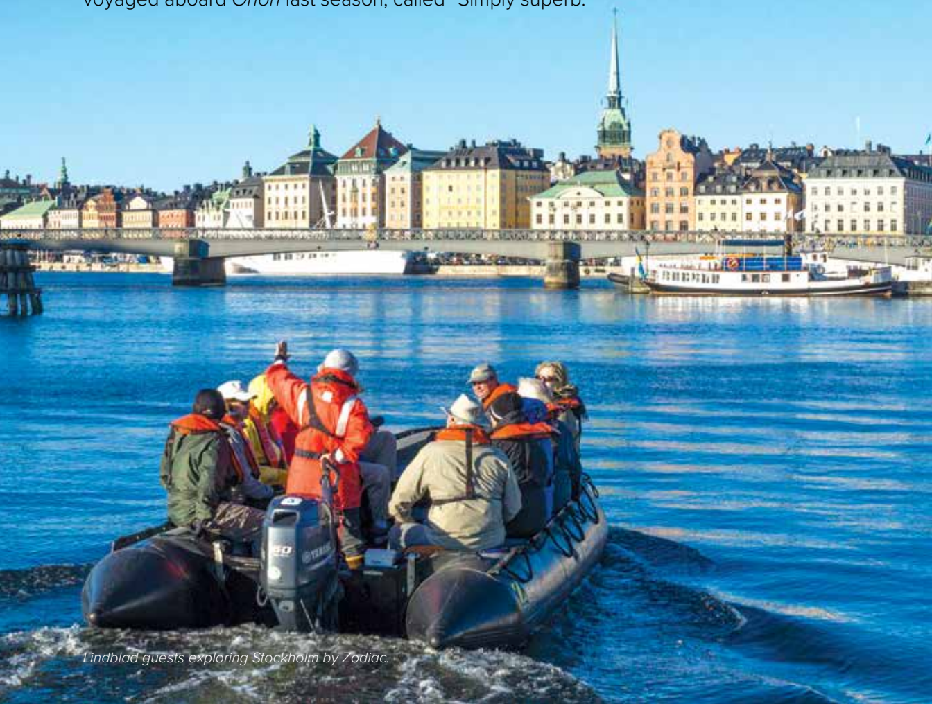
Lindblad guests exploring Stockholm by Zodiac.