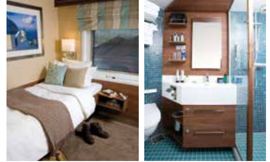
From top: Upper Deck cabin with balcony; a standard bathroom; example of a spacious solo cabin with window.