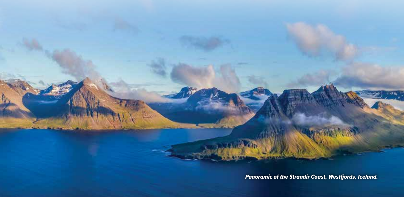
Panoramic of the Ströndir Coast, Westfjords, Iceland.