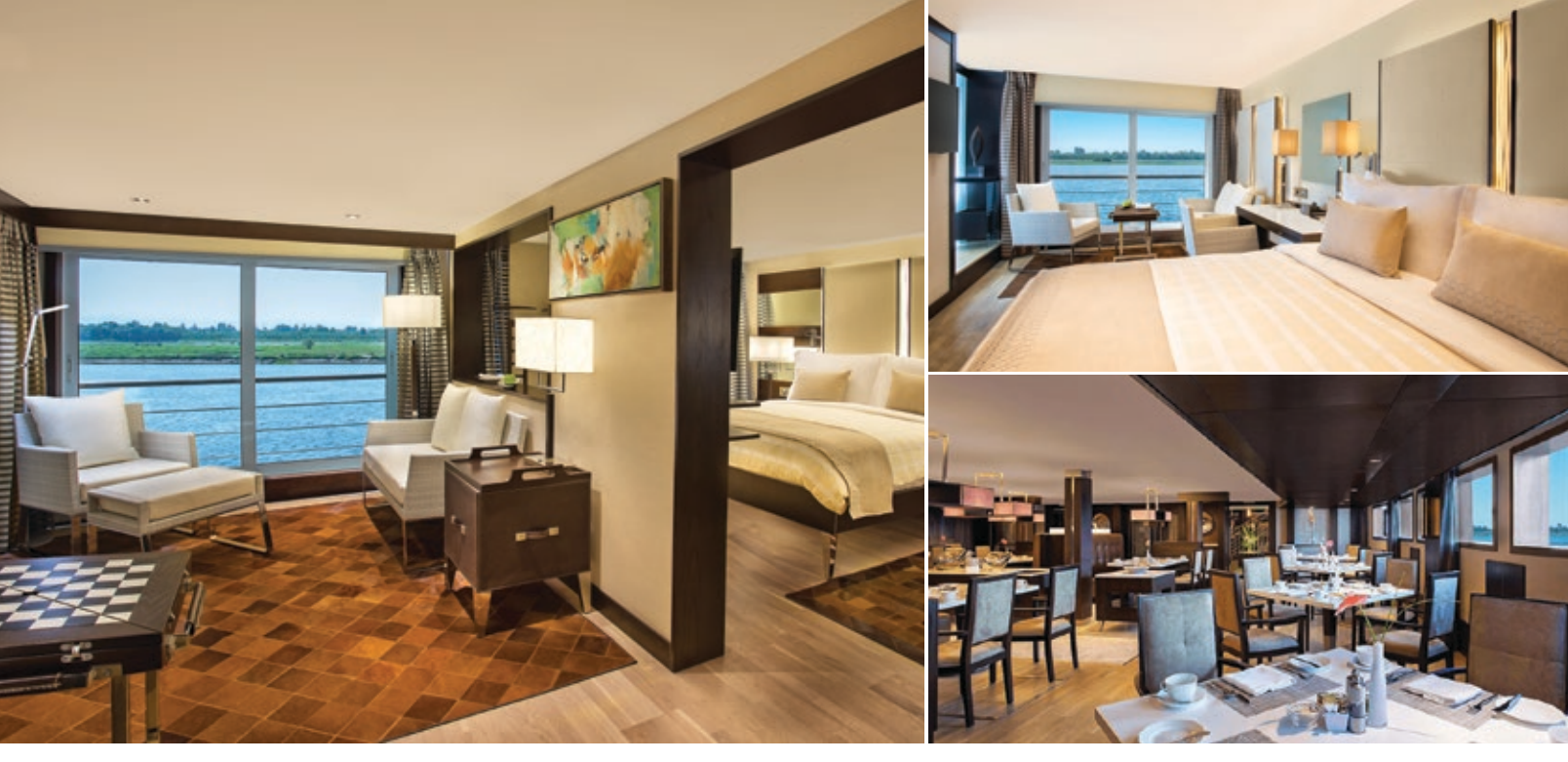
Left to right: Oberoi Philae sailing on the Nile; suite interior (Categories 4 and 5 are similar, however Category 5 features a large deck and jacuzzi tub); standard cabin (Categories 1, 2, and 3 are similar); dining room.

CATEGORY 1: #B01-B06: These cabins are 388 square feet, located on Deck B and have single beds that can be pushed together to make a queen, sitting area, sliding glass windows with French balcony, and a shower.