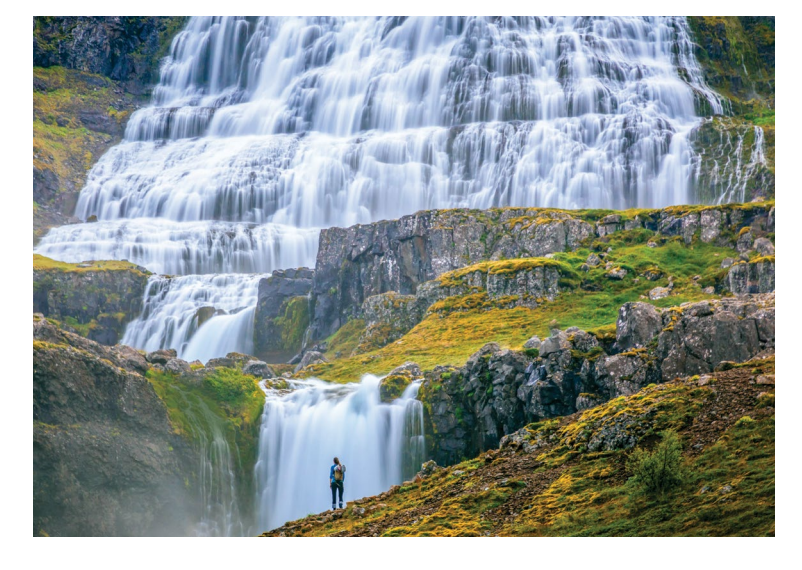
ABOARD NATIONAL GEOGRAPHIC EXPLORER, OR NATIONAL GEOGRAPHIC RESOLUTION

Experience an enchanting land of geological extremes on a satisfying circumnavigation of this land of fire and ice. Encounter vast volcanic landscapes on one of the world's youngest islands, walk on lava fields and ice sheets, and feel the power of gushing hot springs and cascading waterfalls. Cruise into the beautiful, remote Westfjords and spend time on the Arctic Circle spotting nesting seabirds.