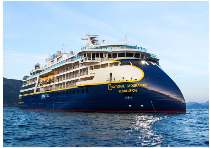
NATIONAL GEOGRAPHIC RESOLUTION 126 Guests | 69 Suites