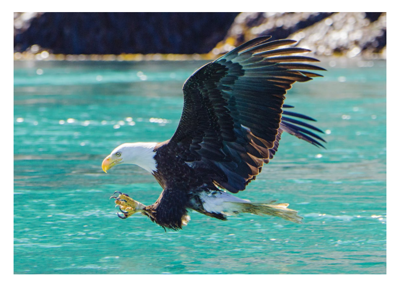
ABOARD NATIONAL GEOGRAPHIC SEA BIRD, NATIONAL GEOGRAPHIC SEA LION

Join our expert team aboard the 62-guest National Geographic Sea Bird for an active exploration. Hike through Alaska's towering rainforest, kayak into glacially carved fjords, and paddleboard along rugged coastlines. Experience Chichagof Island which harbors one of the highest concentrations of brown bears in the world, meet eagles at the Raptor Rehabilitation Center, and cruise by Zodiac to witness the playful nature of sea lions and the majesty of whales in the Inian Islands.