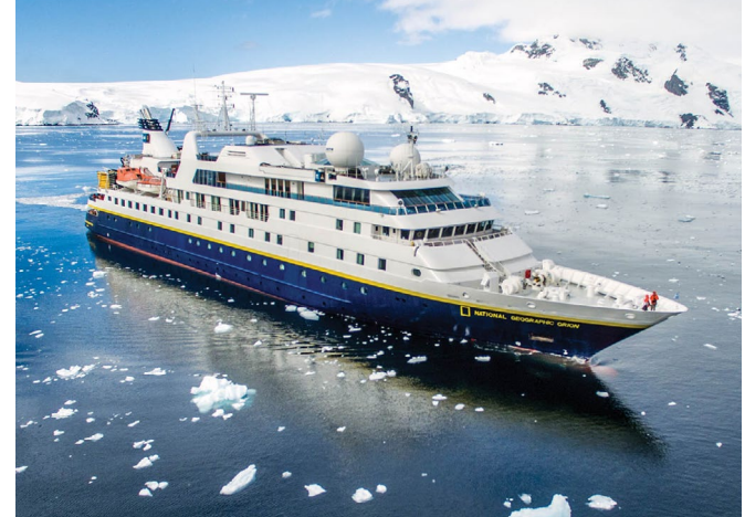
NATIONAL GEOGRAPHIC ORION 102 Guests | 53 Cabins