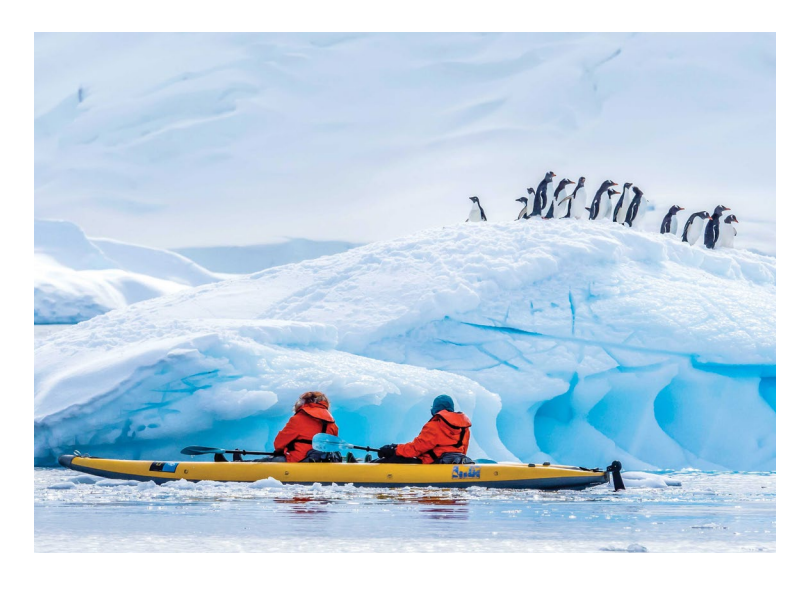
ABOARD NATIONAL GEOGRAPHIC EXPLORER, NATIONAL GEOGRAPHIC ENDURANCE, OR NATIONAL GEOGRAPHIC RESOLUTION

The most exhilarating adventure the planet has to offer, Lindblad's maiden voyage marked the first laymen expedition to Antarctica. For decades, we've been safely bringing guests here to share the wonders of this vast land and sea. Join us to experience the thrill of crunching through the sea ice aboard our fleet of expedition ships to see scores of penguins and whales. Armed with a flexible itinerary that allows us to go where conditions are best and wildlife is most active, we'll marvel at the splendor of Antarctica with plenty of opportunities to hike, kayak, and even possibly cross-country ski in complete tranquility.