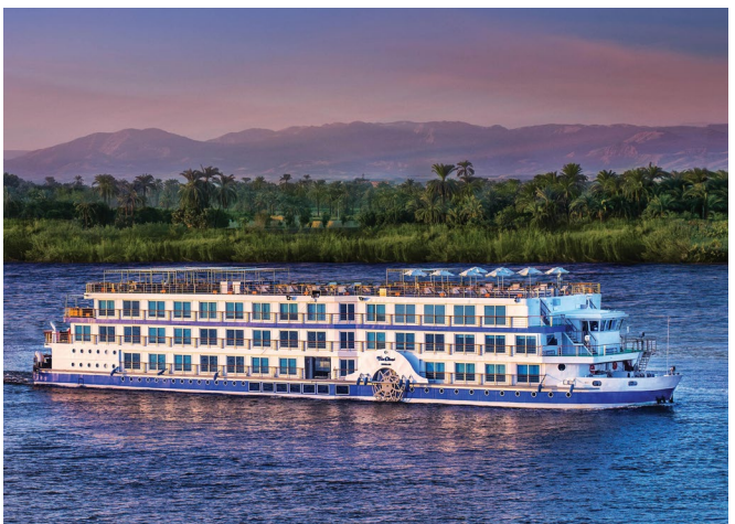
OBEROI PHILAE 42 Guests | 22 Cabins