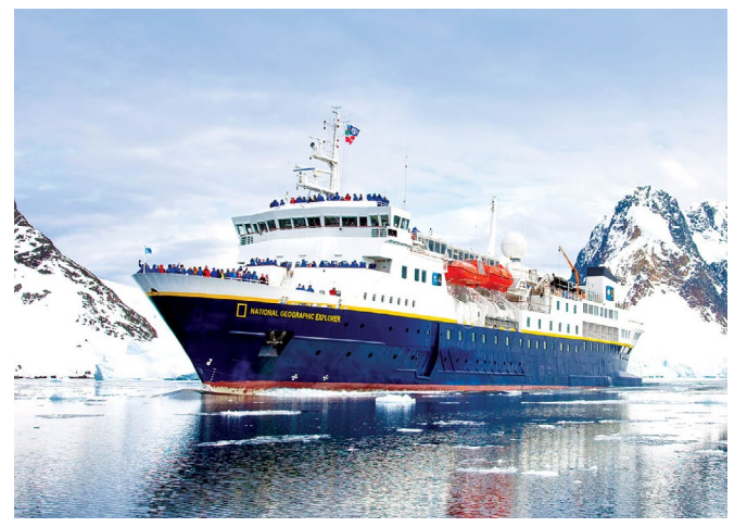
NATIONAL GEOGRAPHIC EXPLORER 148 Guests | 81 Cabins