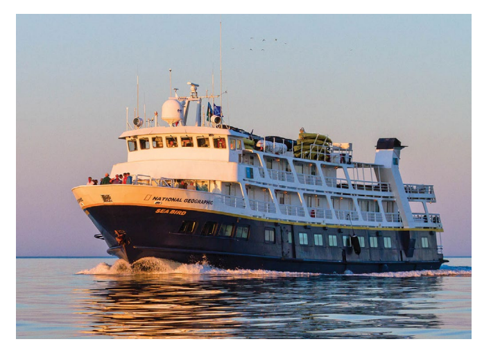
NATIONAL GEOGRAPHIC SEA BIRD 62 Guests | 31 Cabins