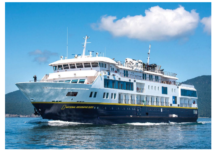
NATIONAL GEOGRAPHIC QUEST 100 Guests | 50 Cabins