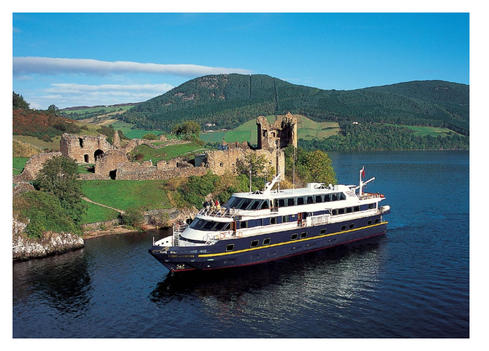
LORD OF THE GLENS 48 Guests | 25 Cabins