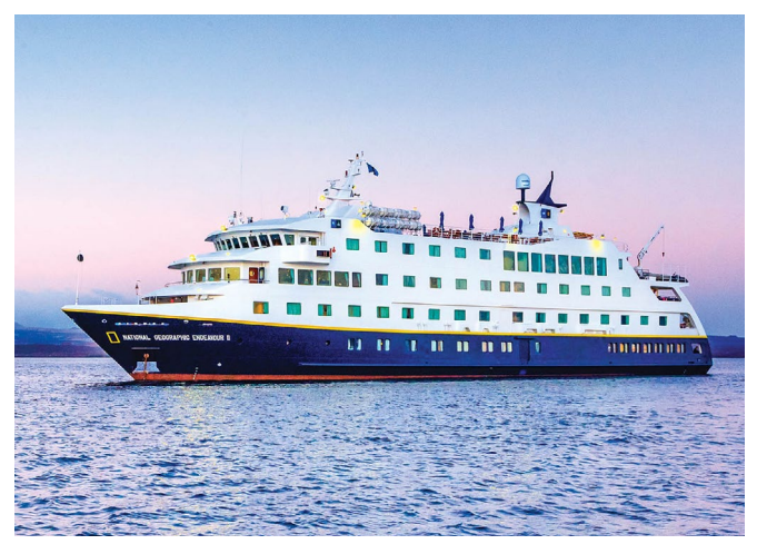
NATIONAL GEOGRAPHIC ENDEAVOUR II 96 Guests | 52 Cabins

Our exceptional ships are perfectly adapted for the unique geography they explore—ranging in size from yacht-like to authentic expedition ships, accommodating 28-148 guests.