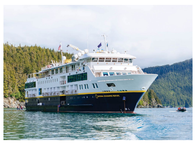
NATIONAL GEOGRAPHIC VENTURE 100 Guests | 50 Cabins