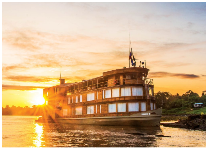
DELFIN II 28 Guests | 14 Cabins