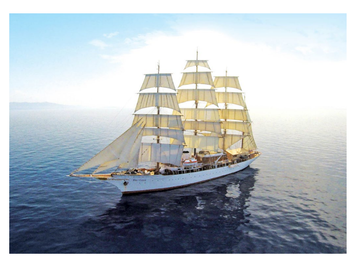
SEA CLOUD 58 Guests | 30 Cabins