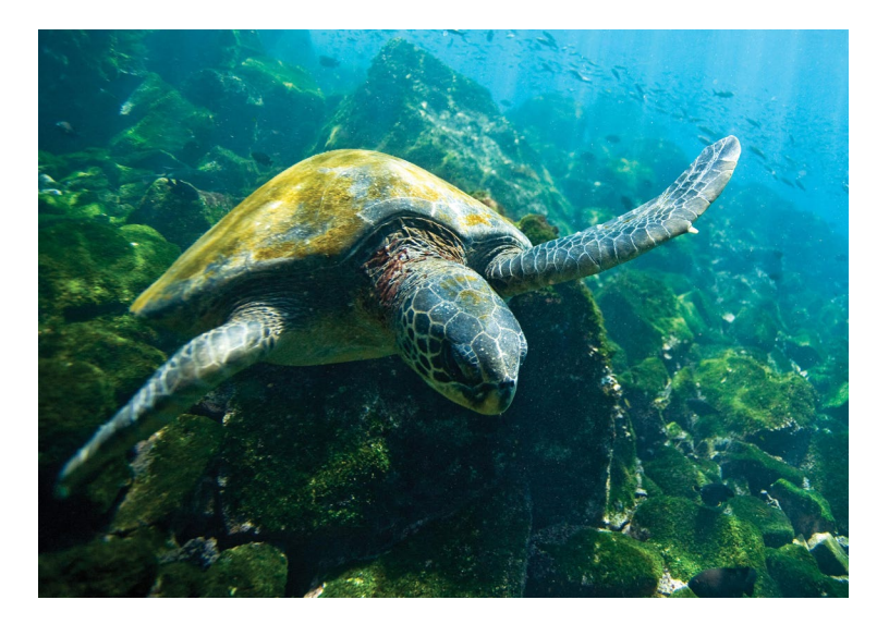
VIEW ITINERARY ONLINE >

Immerse yourself in these enchanting isles aboard the all-new, all-suite National Geographic Islander II featuring beautifully renovated suites, indoor-outdoor dining with panoramic views, and an array of community spaces including an open-air observation deck with a plunge pool, bar, and lounge help you connect with fellow travelers. Plus, our 1:1 guest to crew ration will help you foster an authentic connection to the islands with best-in-class guidance from your team of expert naturalists.