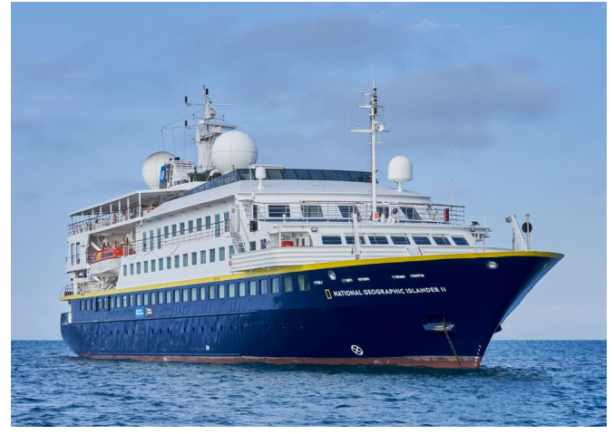
NATIONAL GEOGRAPHIC ISLANDER II 48 Guests | 26 Cabins