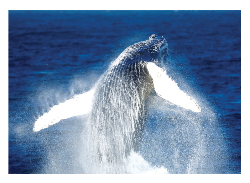
VIEW ITINERARY ONLINE >

Exploring aboard a small, 62-passenger expedition vessel such as the National Geographic Sea Bird means exclusive access to nooks and crannies in the wild and wondrous Magdalena Bay . Join us for an unrivaled experience as we enter and anchor in protected waters that serve as a gray whale nursery lagoon to witness the curious, playful nature of calves and their watchful mothers. Beyond the bay there are beaches to bike, mangroves to kayak, and sand dunes to wander.