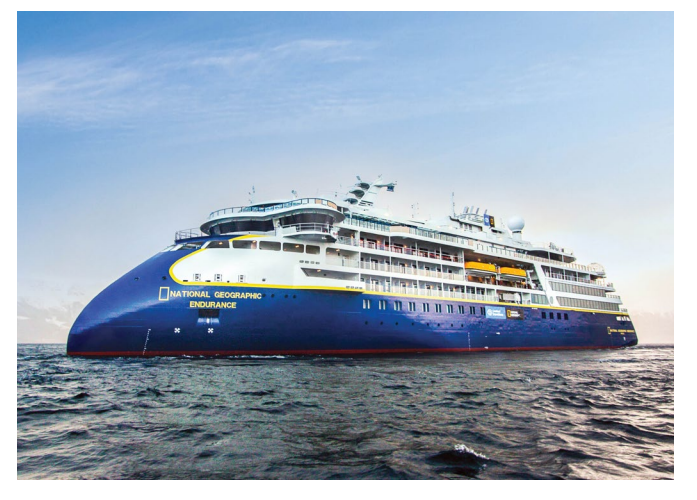
NATIONAL GEOGRAPHIC ENDURANCE 126 Guests | 69 Cabins