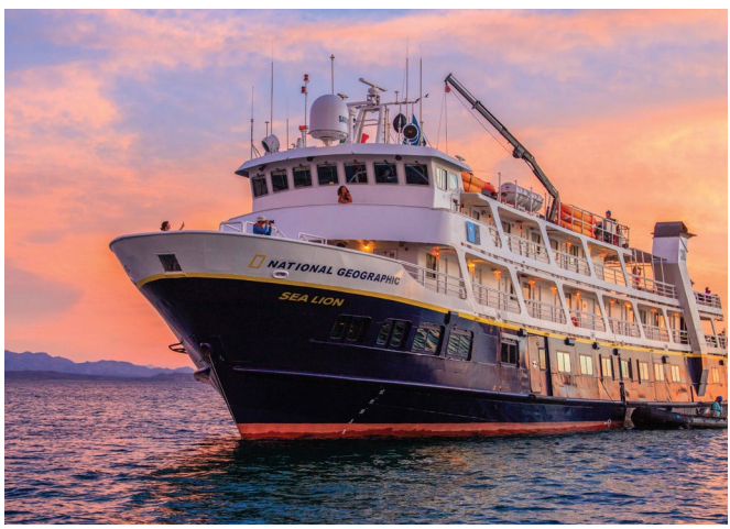
NATIONAL GEOGRAPHIC SEA LION 62 Guests | 31 Cabins