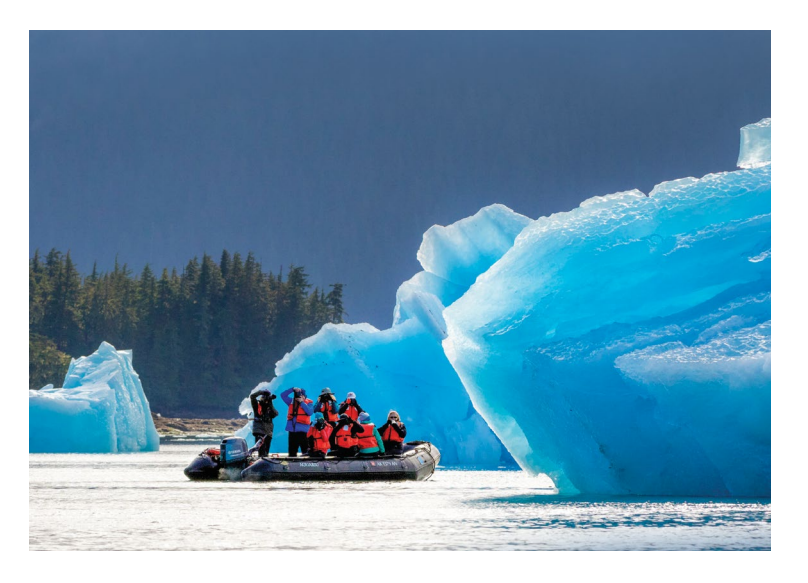
ABOARD NATIONAL GEOGRAPHIC QUEST, NATIONAL GEOGRAPHIC VENTURE