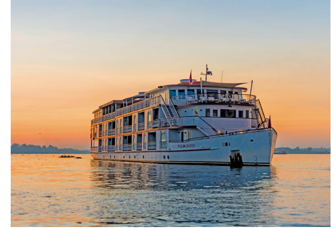
THE JAHAN 48 Guests | 24 Cabins