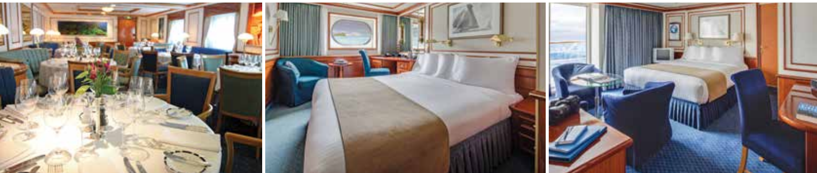
Left to right: Main lounge; National Geographic Orion; our hotel staff will do whatever it takes to ensure your comfort and satisfaction aboard; National Geographic Orion's dining room features no assigned seating for casual, easy mingling; Category 3 suite with window; Category 6 Owner's suite with French balcony.

CATEGORY 1: Main Deck with oval window #316, 318, 319-321