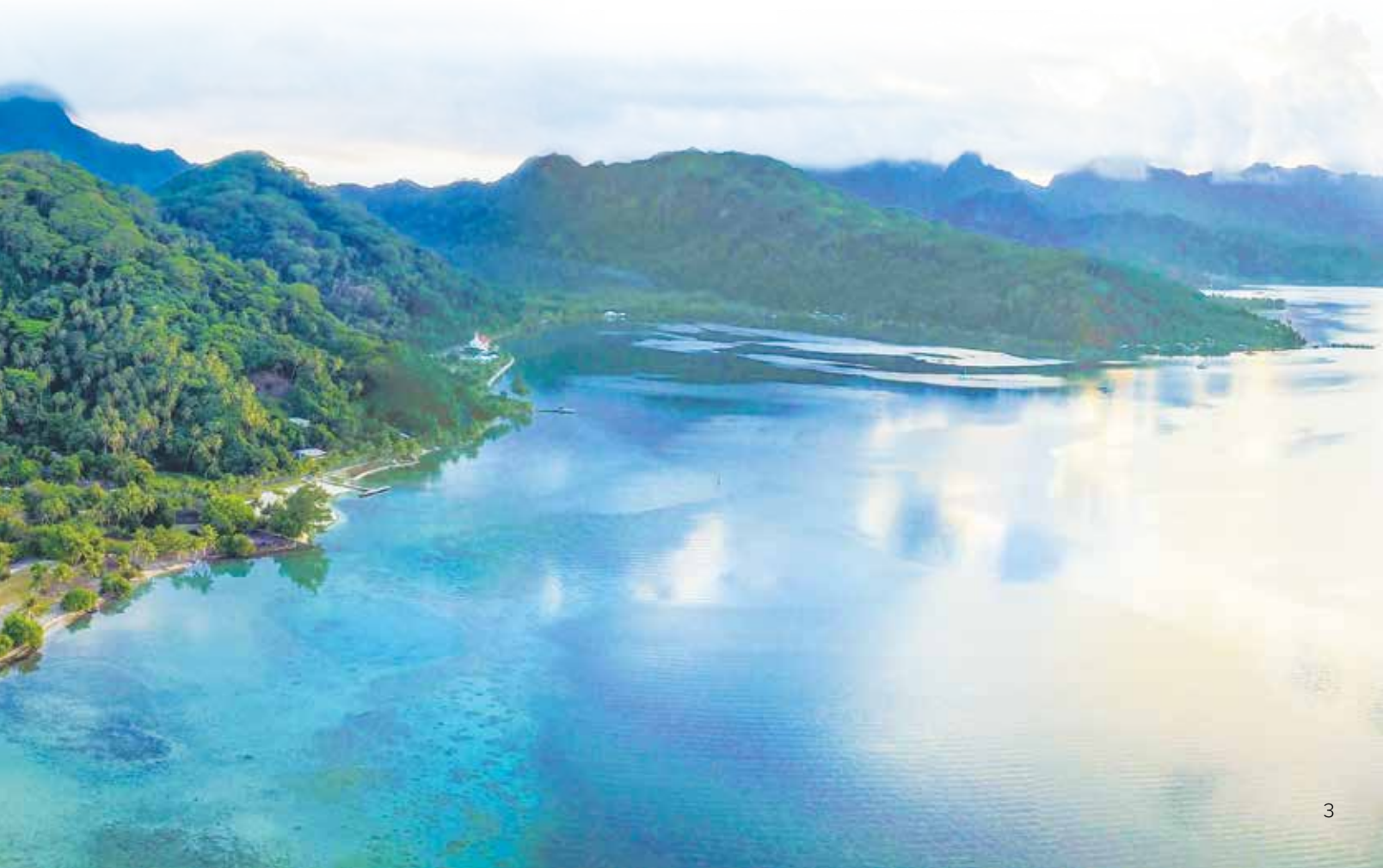
This spread: Aerial view of Ra'iatea, French Polynesia.