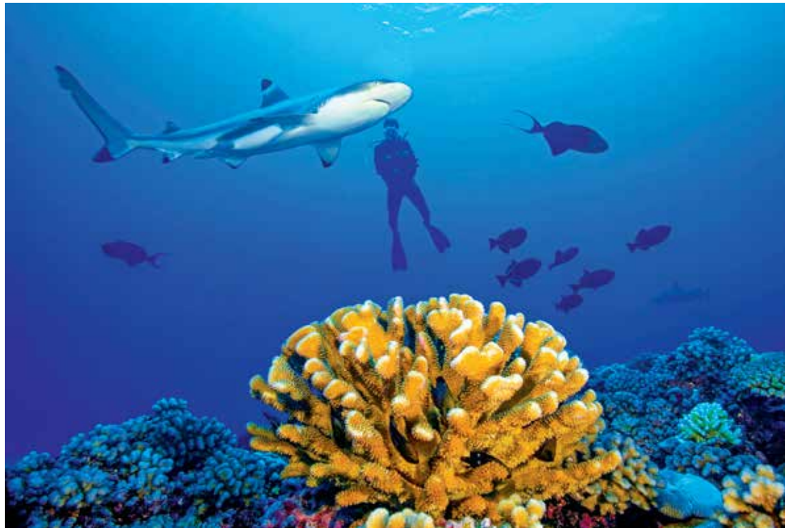
Left to right: snorkeling in the pristine turquoise south Pacific Ocean; fishing in Huahine; a blacktip reef shark swims above a colorful coral reef