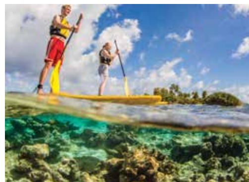
Left to right: Underwater in Bora Bora, French Polynesia; Stand up paddle boarding in the Tuamotus.

For many, the sight of the high central peak of Mount Otemanu signaling Bora Bora , is a kind of déjà vu—perhaps never seen, yet deeply familiar—that's how iconic this Society Island is. Surrounded by shallow and deep reefs and a bright, almost hypnotic turquoise lagoon, Bora Bora, formed 7 million years ago, was inhabited by the first Polynesians.