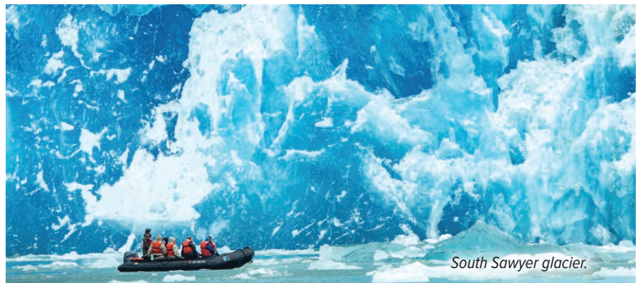
South Sawyer glacier.