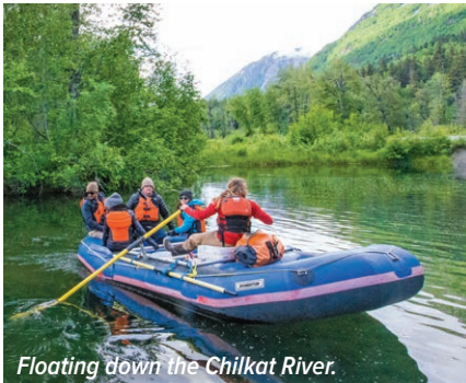
Floating down the Chilkat River.

Immerse yourself in the wilds of Alaska as you kayak deep into one of Baranof or Chichagof Island's countless, breathtaking bays. Hear bald eagles call from the tops of towering spruce and hemlock trees as you paddle through these mirror-calm waters. In the afternoon, learn the stories of this ancient rain forest on an adventurous hike with your naturalist guide. (B,L,D)