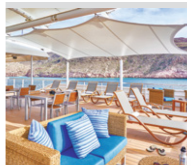
Above: Dining room with floor-to-ceiling windows; spacious Category 3 cabin; comfortable outdoor space for relaxing and wildlife viewing.