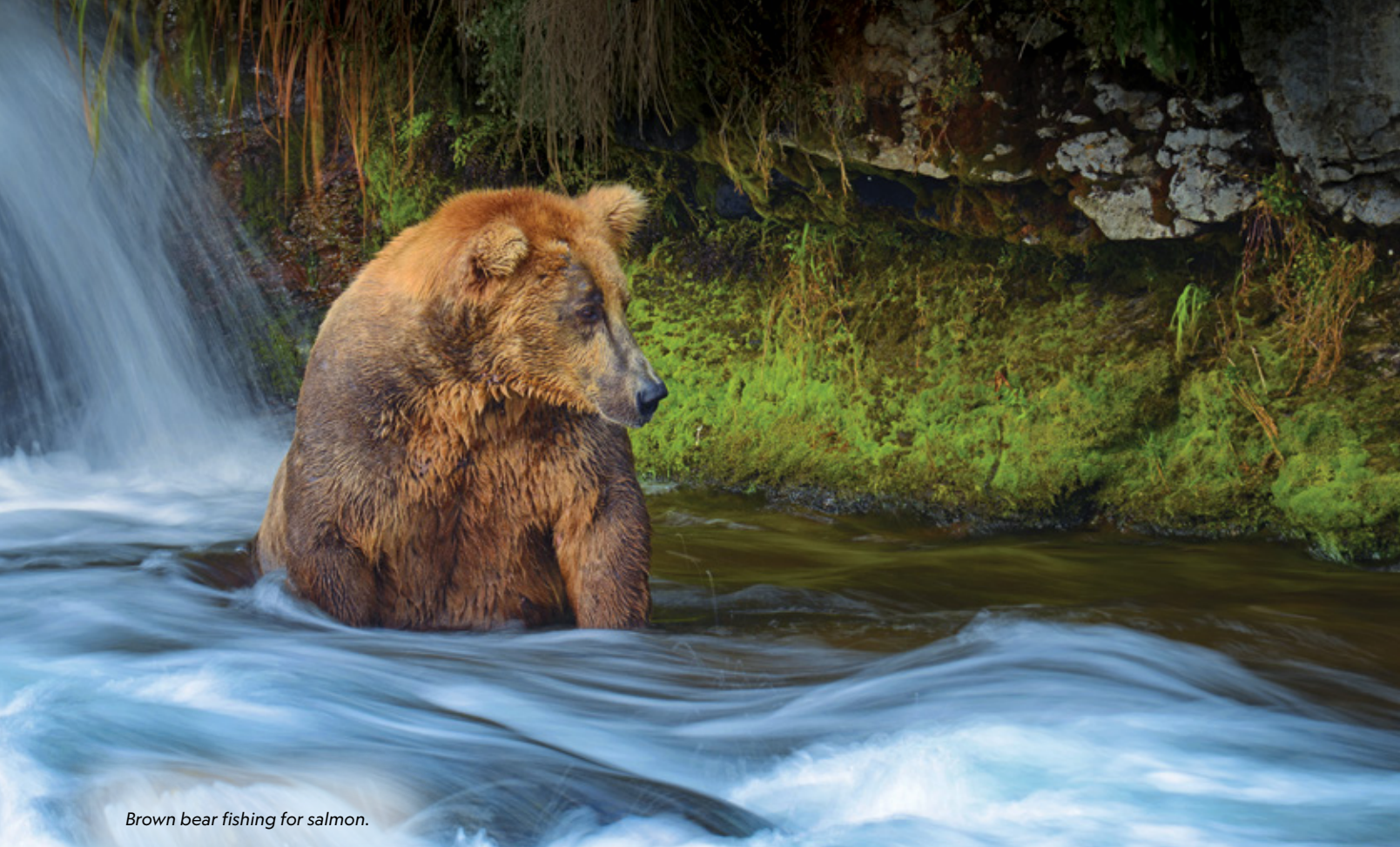
Brown bear fishing for salmon.