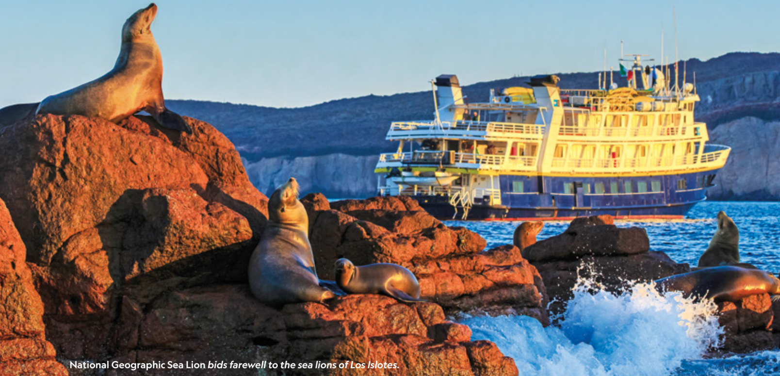
National Geographic Sea Lion bids farewell to the sea lions of Los Islotes.