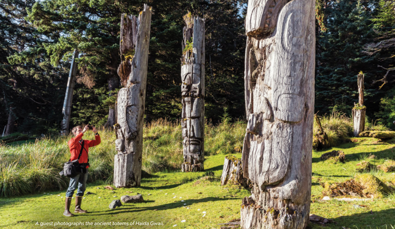
A guest photographs the ancient totems of Haida Gwaii.