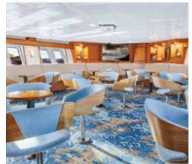
Above: Passengers take in sweeping views from the deck of National Geographic Sea Lion; bright and comfortable lounge where guests gather for the Daily Recap; spacious Category 3 cabin.