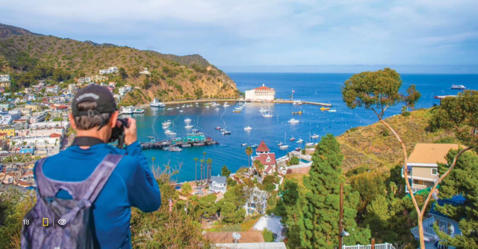
Santa Catalina Island.