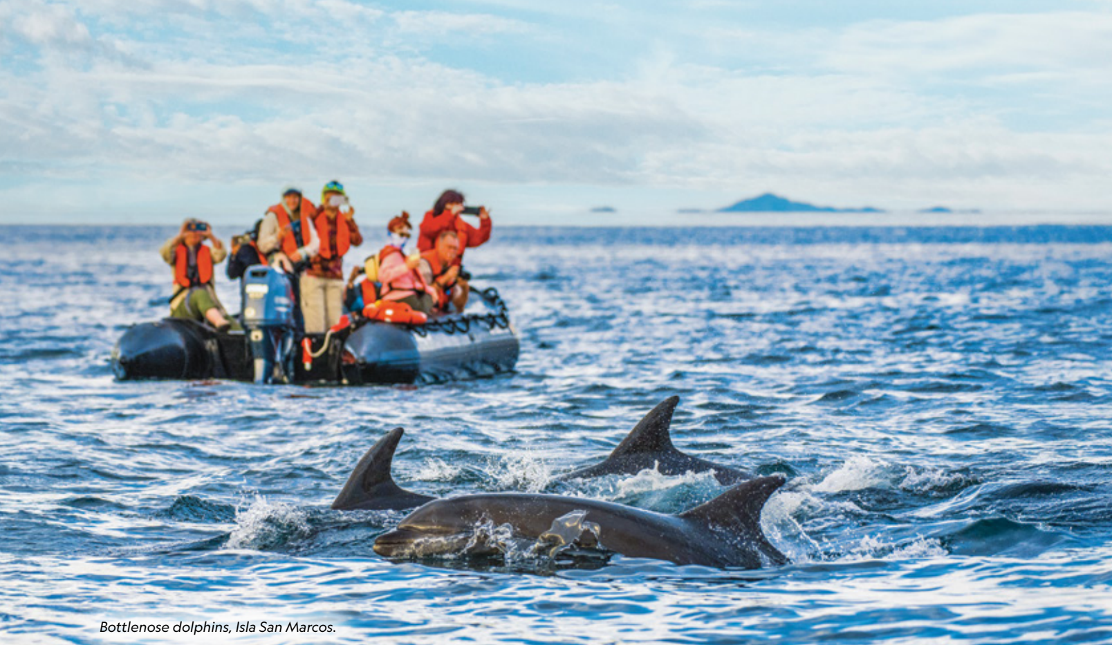
Bottlenose dolphins, Isla San Marcos.