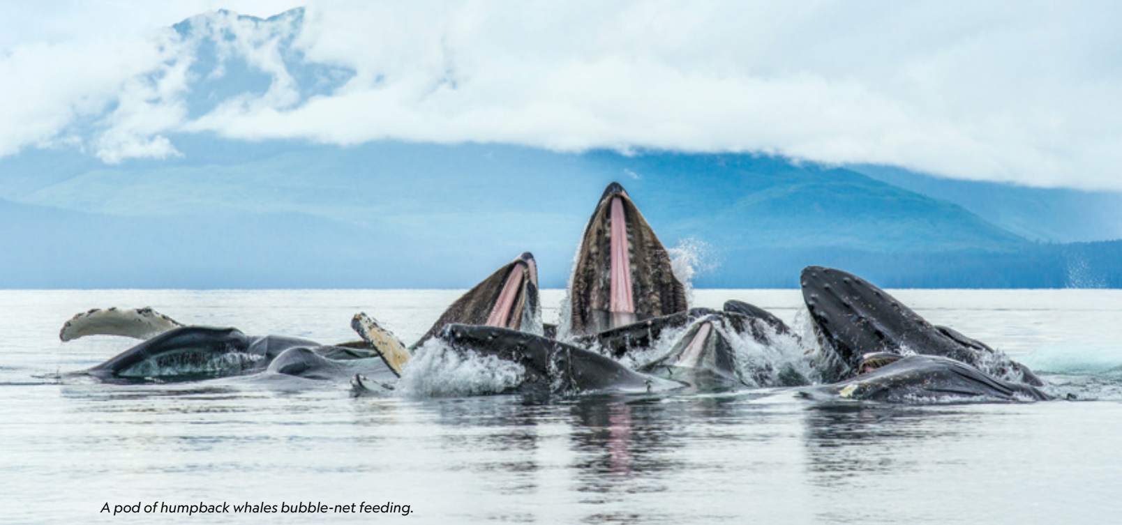
A pod of humpback whales bubble-net feeding.