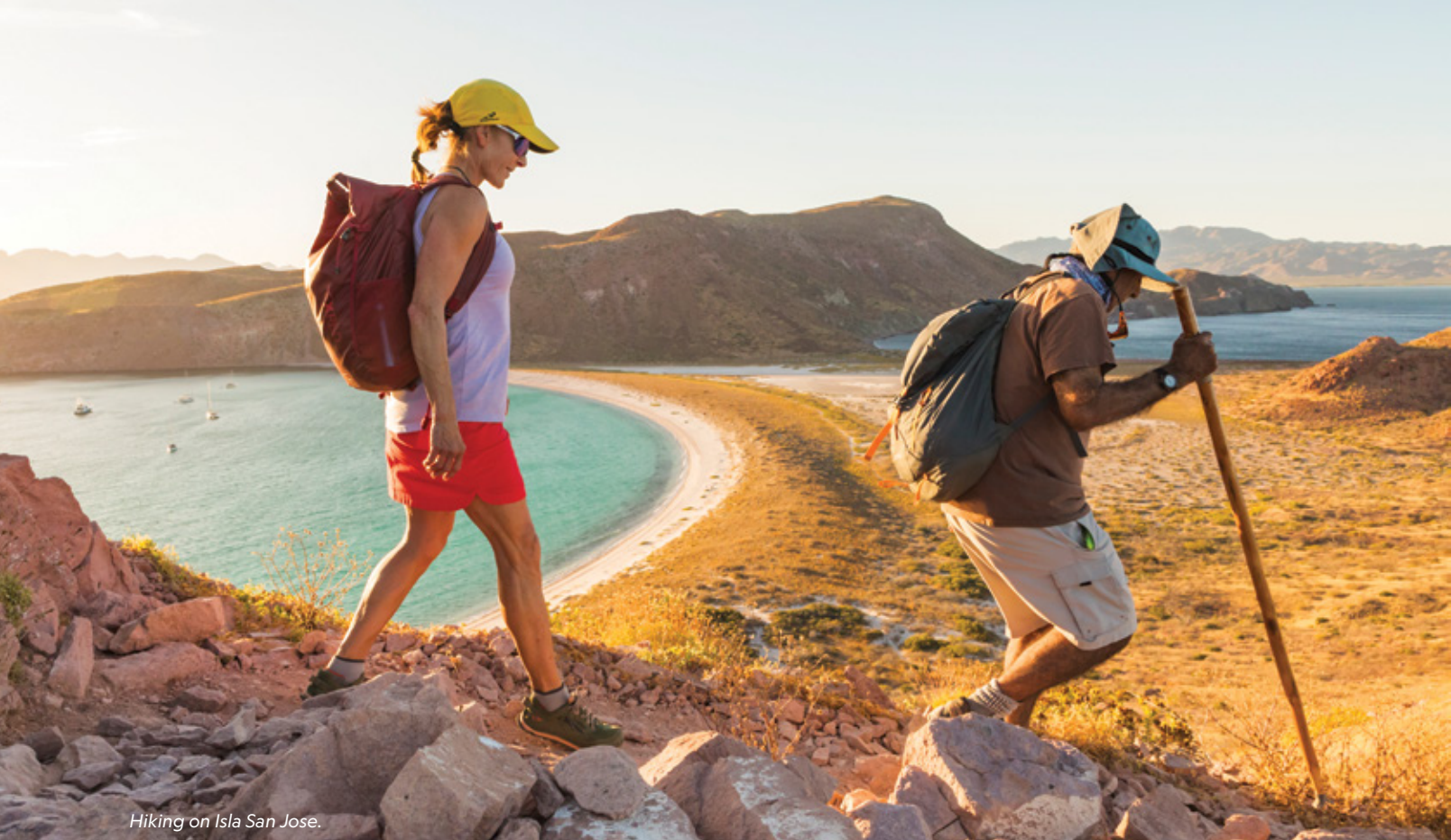
Hiking on Isla San Jose.