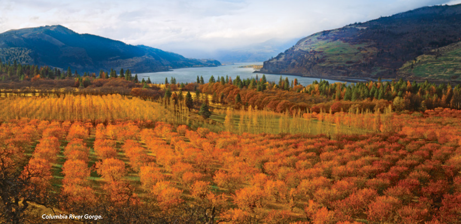
Columbia River Gorge.