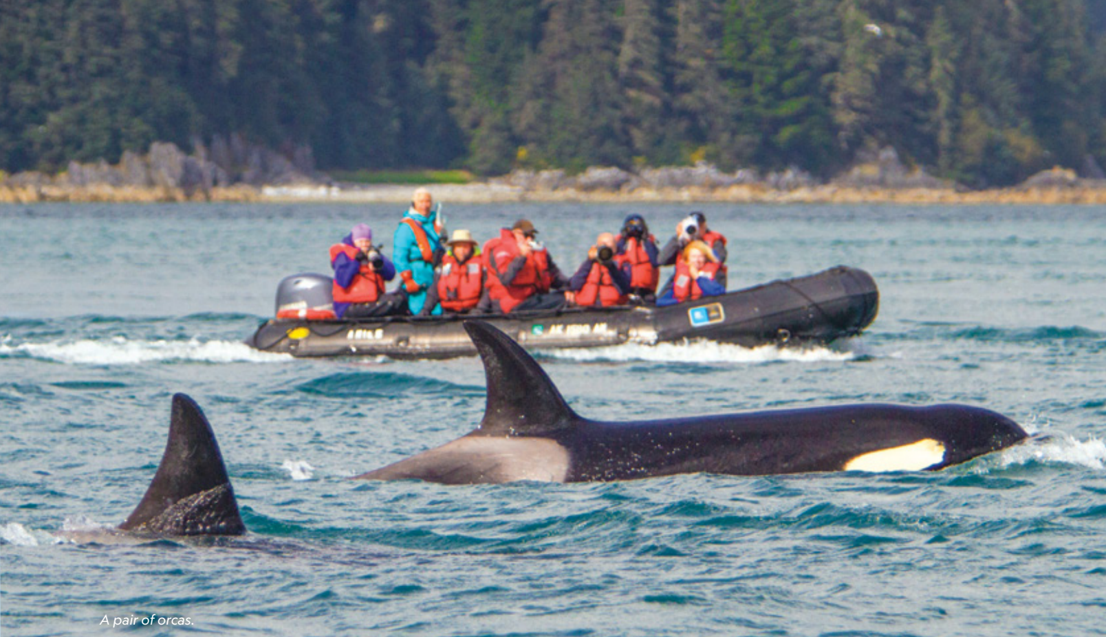
A pair of orcas.