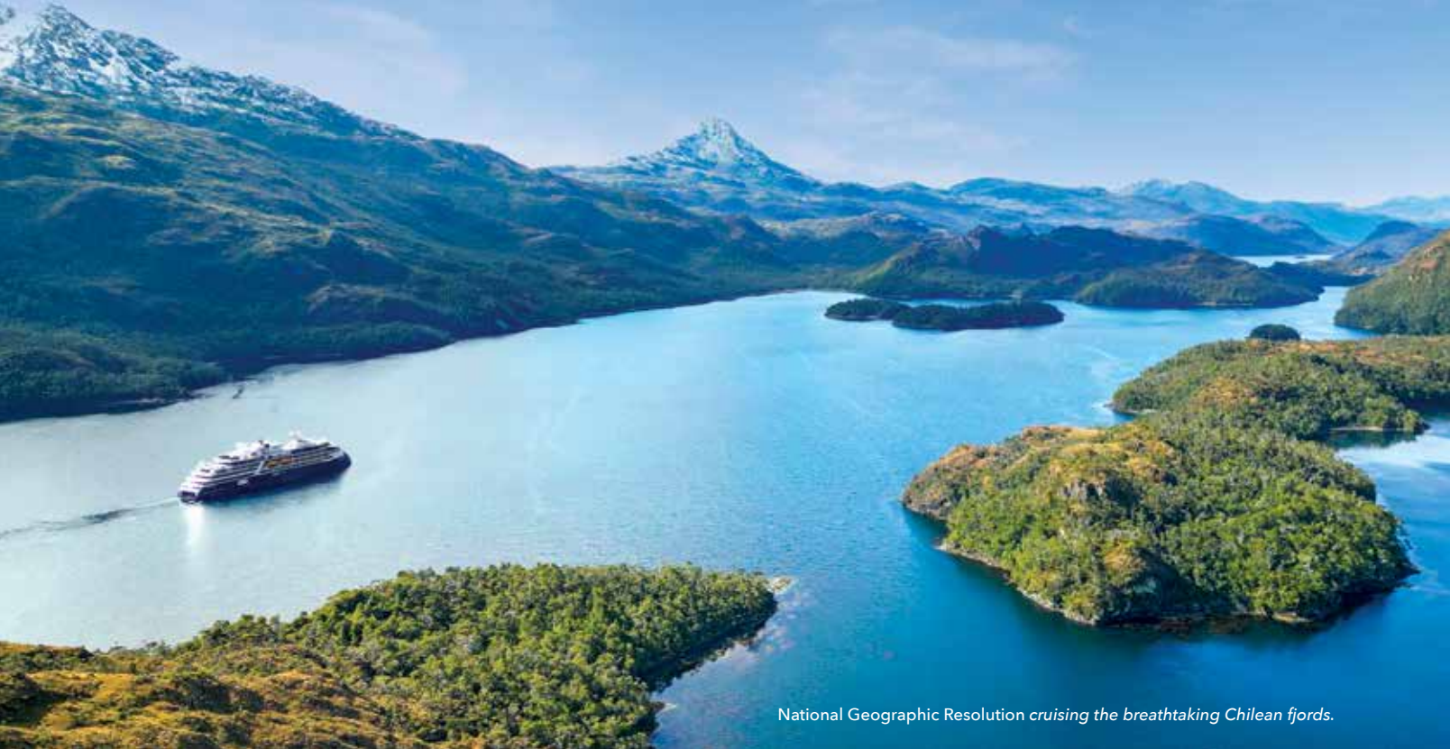
National Geographic Resolution cruising the breathtaking Chilean fjords.