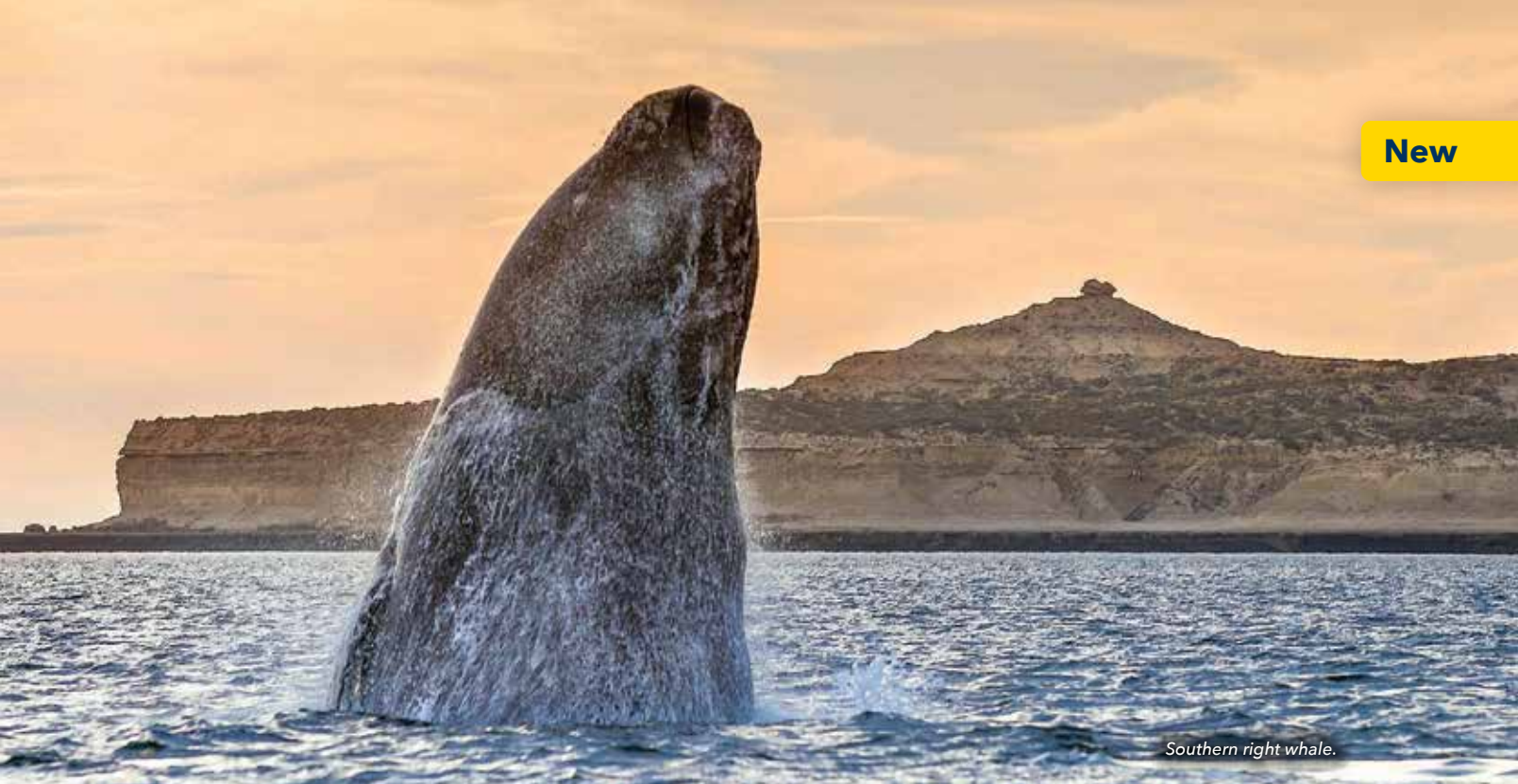
Southern right whale.