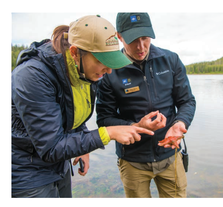
From left to right: Emperor penguins sit atop an ice crevasse, Antarctica; A Lindblad Expeditions field staff member illuminates the natural wonders of Alaska for a guest.